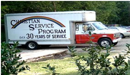
Christian Service pick-up and delivery van

“The Staff was so helpful in encouraging me to obtain my goals and I have made some life-long friends at Christian Service”.